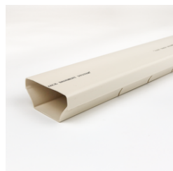
Fast Track Channel Item# FT4449-90FT

Fast Track components: corners, inspection ports, tees, sump drops and snap joiners.