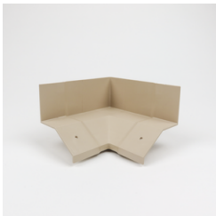
Inside Corner Item# DM5557