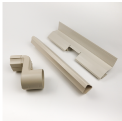
Sump Drop Kit Item# DM3337