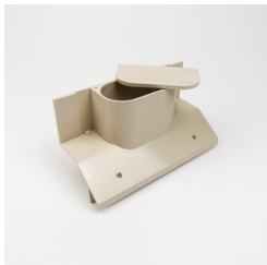
Inspection Port Item# DM6667