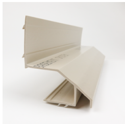
Drain Main Channel (6ft Main Sections) Item# DM4447